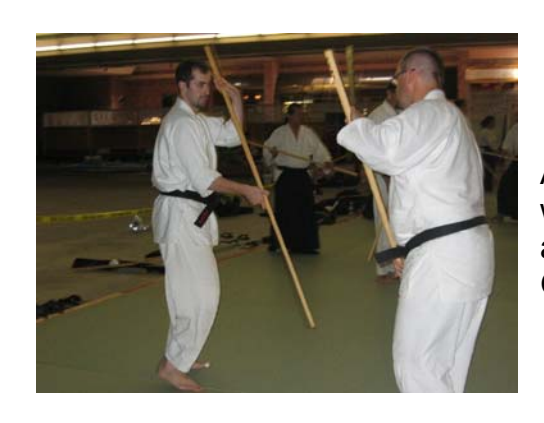
Aikibujutsu, Bo and tanto were welcome new additions to the Shochu Geiko curriculum