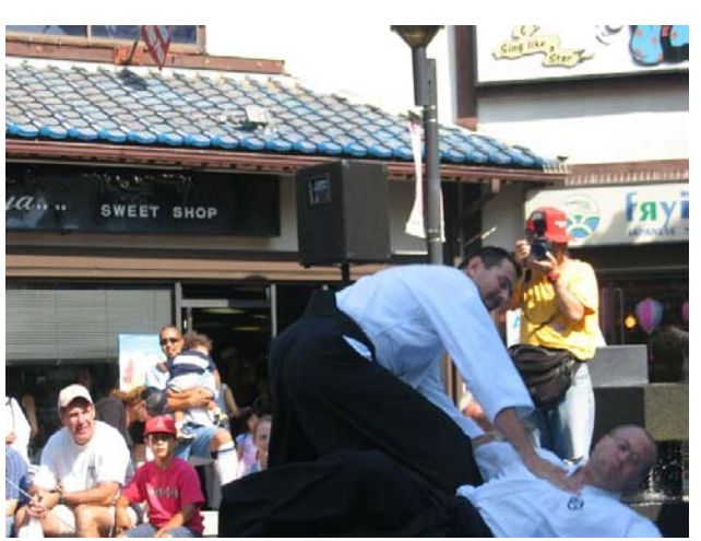
Arizona whips out a can of Aikibujutsu