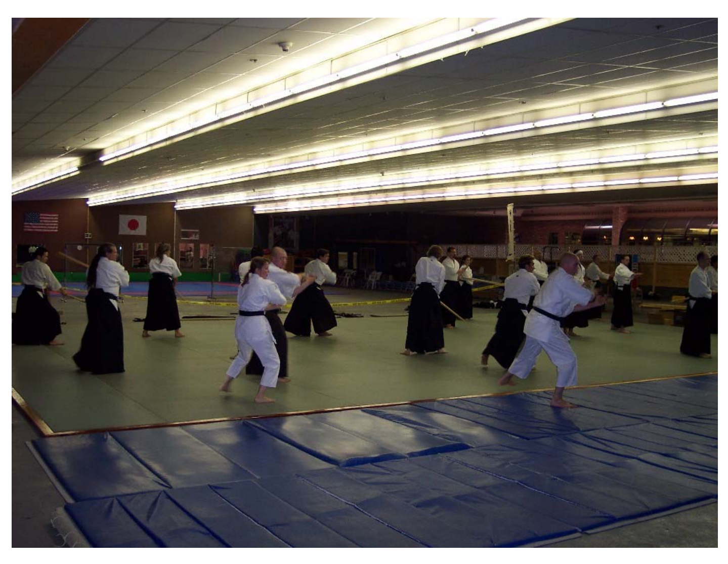
Can you spot the Shinkendo flag in this picture?