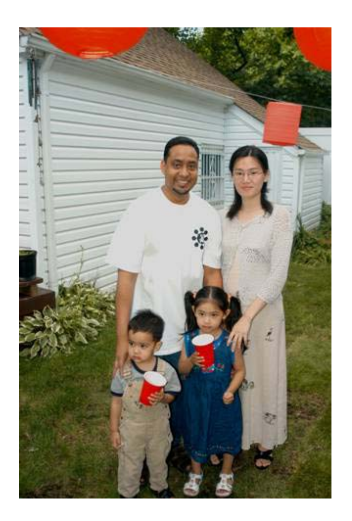
"The Bacchus Family"