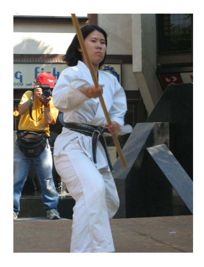
Shinkendo wants YOU!