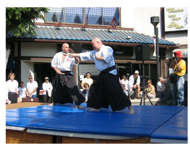
Atlanta demos Tanto #1