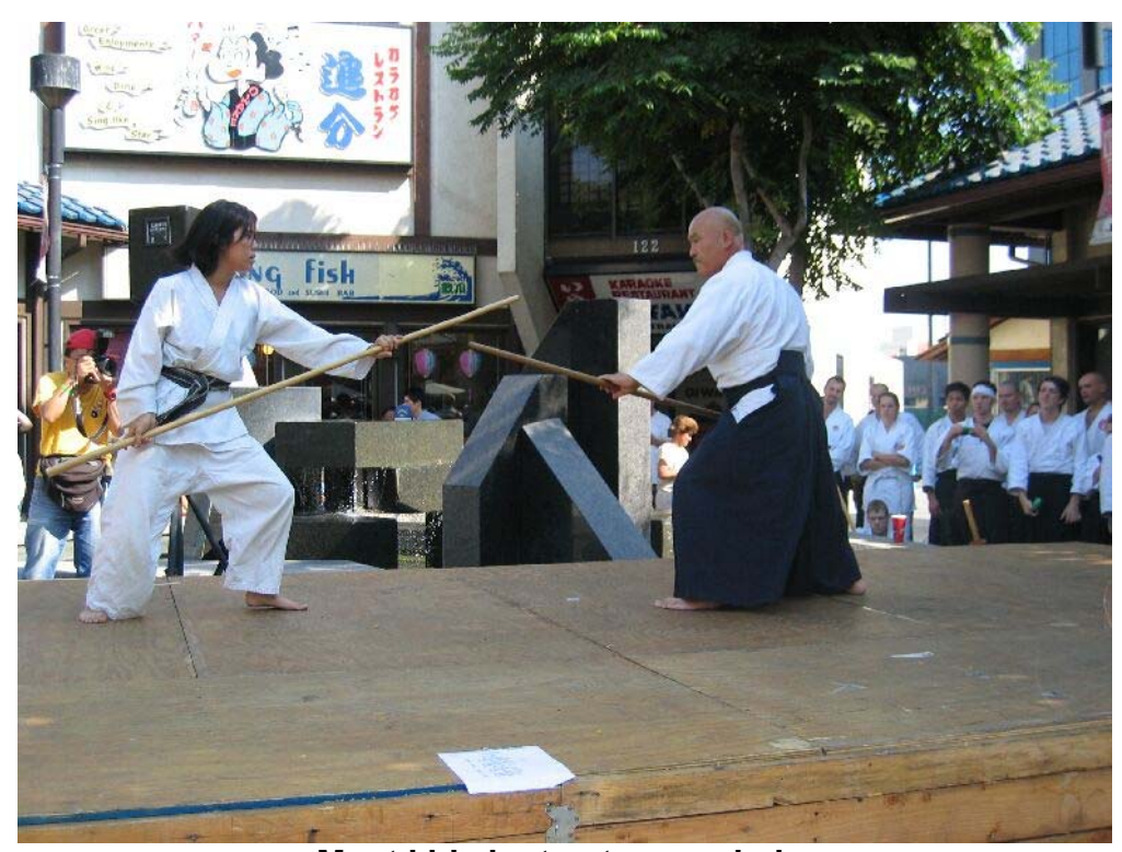
Most kids just get grounded...